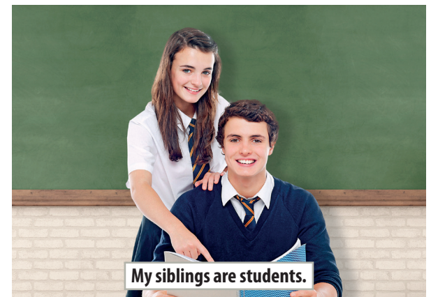
My siblings are students.