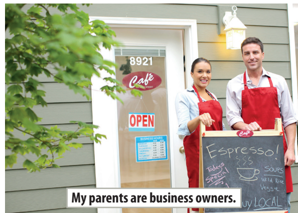
My parents are business owners.