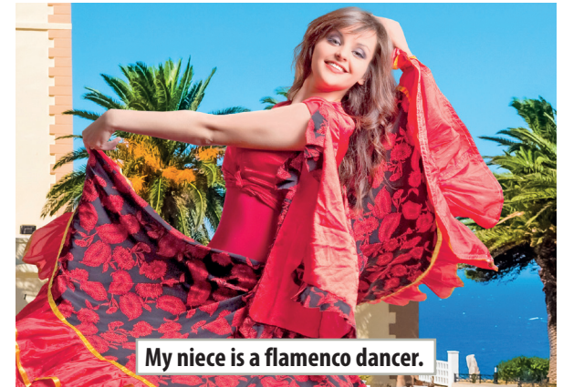
My niece is a flamenco dancer.