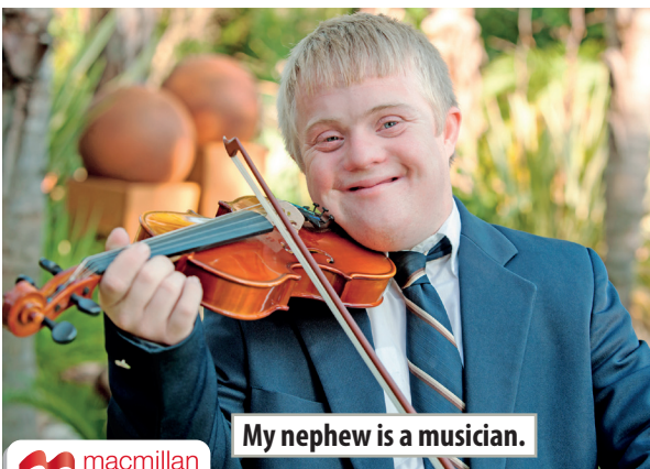
My nephew is a musician.