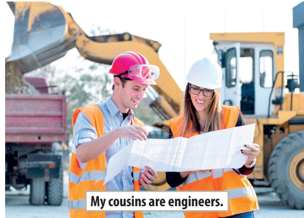
My cousins are engineers.