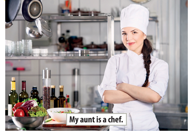
My aunt is a chef.