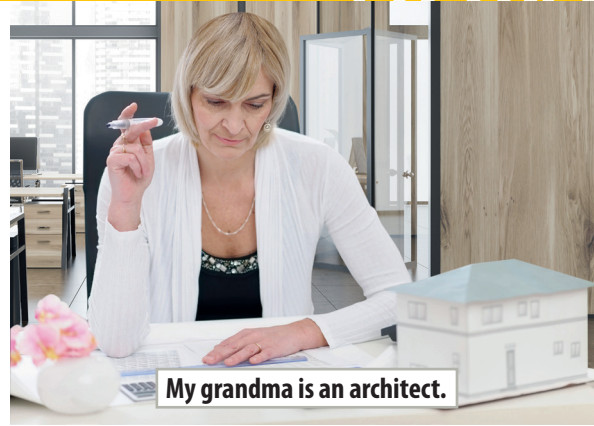
My grandma is an architect.