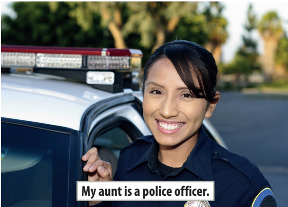
My aunt is a police officer.